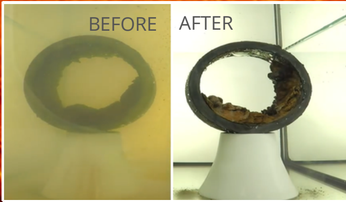
Preventing secondary contamination of water in the pipeline system.